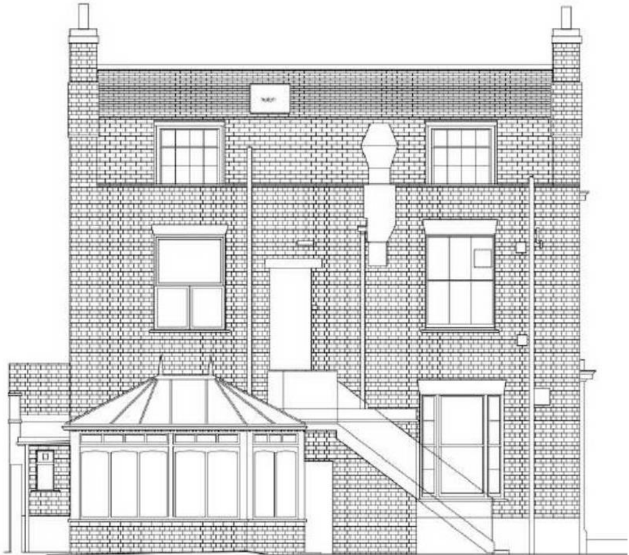
NORTH-WEST ELEVATION 2 (07.05-4.02.3)