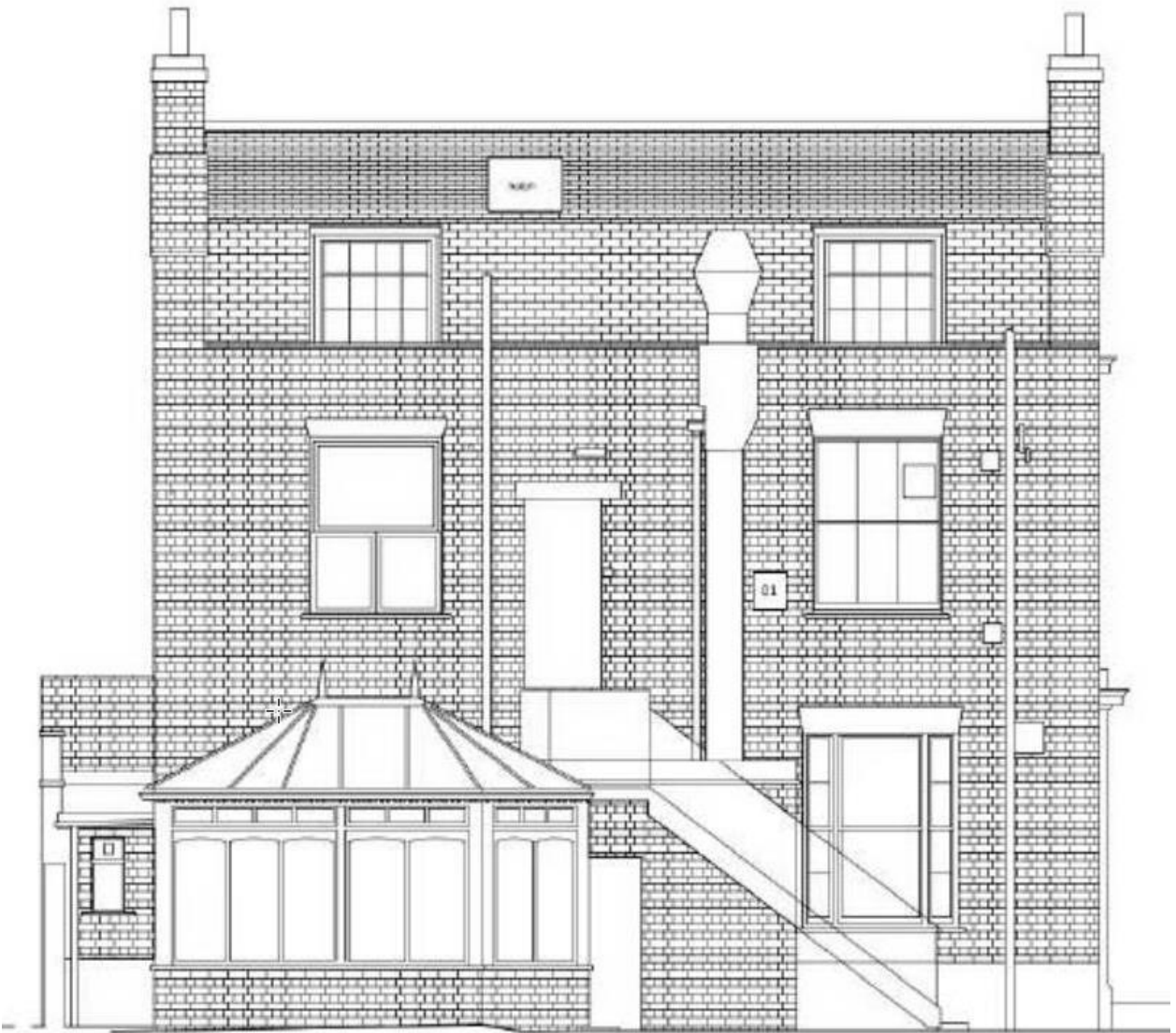
NORTH-WEST ELEVATION 2 (07.05-A.O.B.)